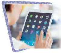
Fig. 1.5 A tablet PC

Netbooks were invented in 2007. They became popular in 2009.