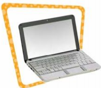
Fig. 14 A netbook