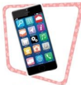
Fig. 1.6 A smartphone