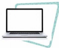
Fig. 13 A laptop

A laptop is a small computer that can fit in your lap. It is battery operated. We charge the battery like we do for a mobile phone. We can carry a laptop to work or anywhere else. A laptop is also called a notebook computer.