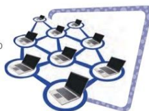
Fig. 1.8 Computer network

In big offices and banks, many computers are connected to each other. This makes it easy to send files from one computer to another. It is called computer networking.