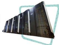
Fig. 1.7 Supercomputer

A supercomputer is a very big computer. It works very fast. It is used in big offices. Supercomputers are used in very specialized areas, such as weather forecasting, scientific research, working of aircrafts, and rocket launches.