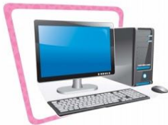
Fig. 12 A desktop computer

Computers are of many kinds and sizes. Let us learn about some of them.