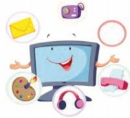
Fig. 11 Uses of a computer