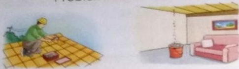
Problem 1: Leaking roof